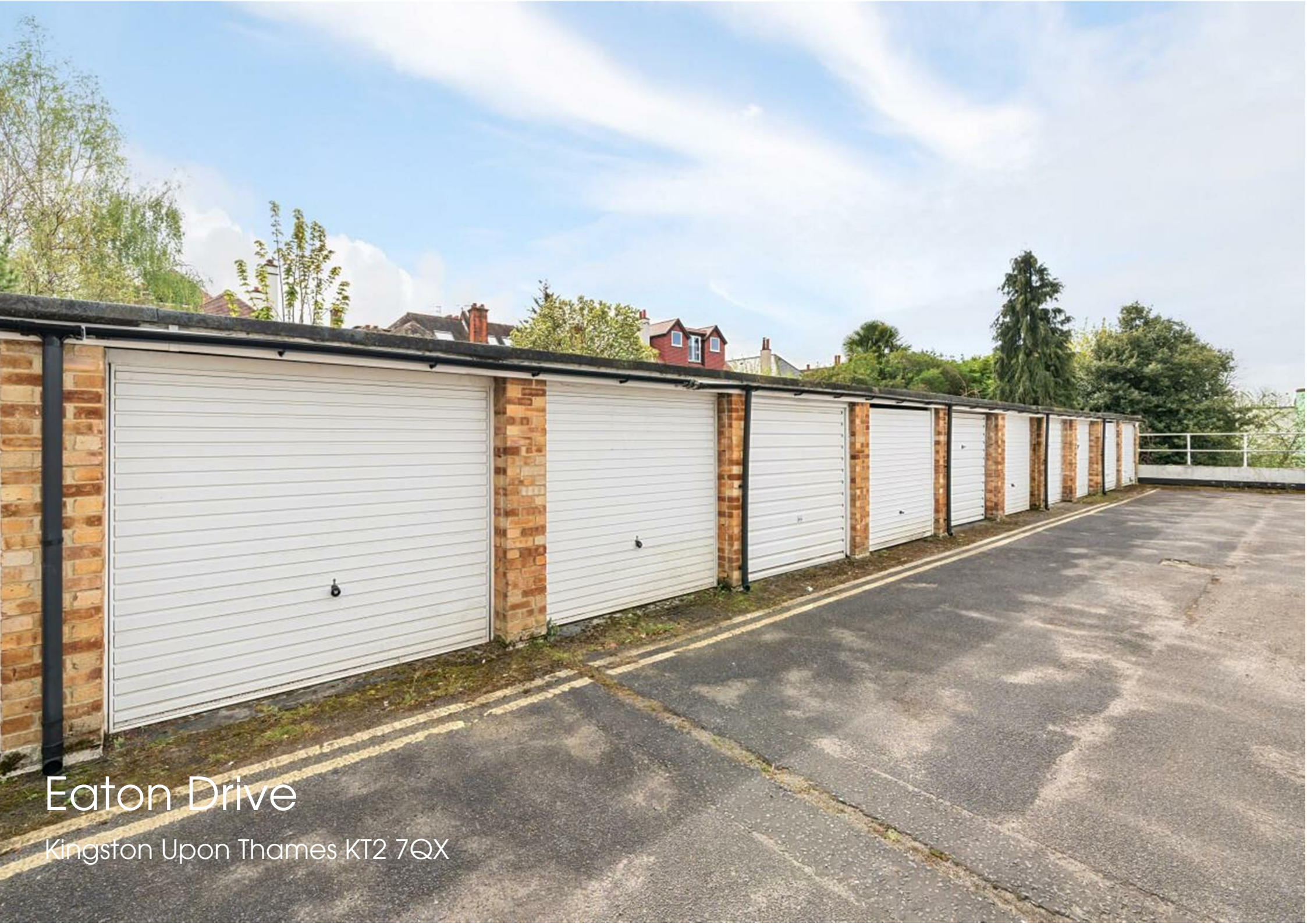
Eaton Drive Kingston Upon Thames KT2 7QX